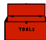
Dulwich Wood Learning Toolkit