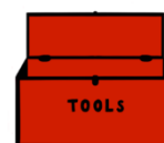
Dulwich Wood Learning Toolkit

In phonics, we are really focussing on recognising those tricky words when reading. We have given each child a copy of the tricky words for phase 3, which we have already learned, and phase 4, which need to be learned by the end of Reception.