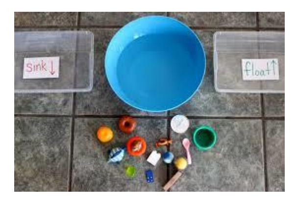
A very simple science lesson for toddlers.